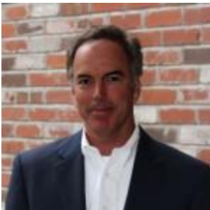
About Jim 'Slim' Mimplitz, P.E. ...

Are you interested in learning more about how the Signalizer, when paired with a Neptune flow meter, can provide a functional alternative to the sunsetted Neptune Tricon/E3 transmitter? ...and more? Give us a call!... We'll be glad to discuss the details!