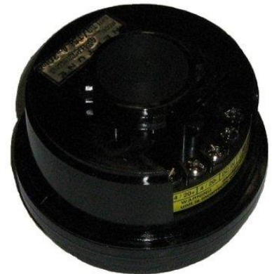
Neptune Tricon/E3 Transmitter

The Tricon/E3 provided a 4-20mA flow rate signal, plus an active voltage pulse output proportional to volume of water passing through the meter. The signal wires would generally be connected as the input to a batch controller, RTU, or PLC.