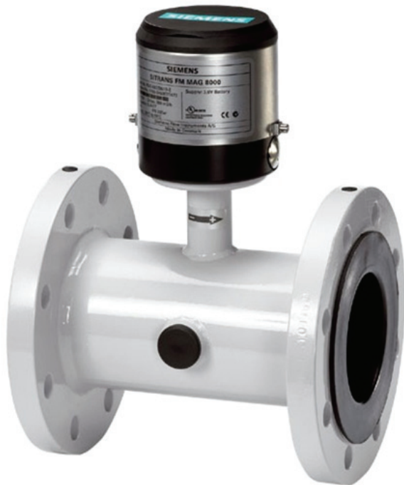
The FM MAG 8000 Magnetic Flow Meter From Siemens Industry.

SCADAmetrics is pleased to announce that its EtherMeter SCADA/Meter Gateway is verified compatible with the FM MAG 8000 magnetic flow meter , manufactured by Siemens Industry .