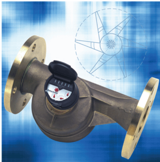
Spectrum Single-Jet Water Meter And HawkeyeOER Register By Metron-Farnier

EtherMeter™-compatibility means that totalization and flow-rate data from Metron-Farnier's meters may now be interrogated, error-free, using the MODBUS® protocol.