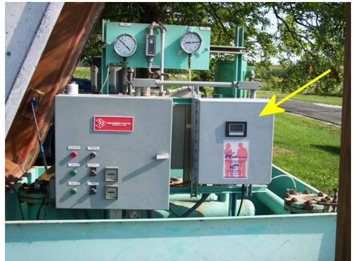
Pump Station TeleTransducer™ Enclosure (Right). Note the 3-Inch Touch Screen Operator Interface.

The pump station features a 3-Inch Touch Screen Interface mounted on the front door of the enclosure. The touch screen displays the remote water tower level, and also enables setpoints to be changed within the on-screen menu system. The screen also features a backlight, so it’s even readable at night. Both Lead and Lag pump settings are available, and the controller may also be set to alternate the pumps. Because the system is designed for pump control, interaction is intuitive, user-friendly, and uncluttered.