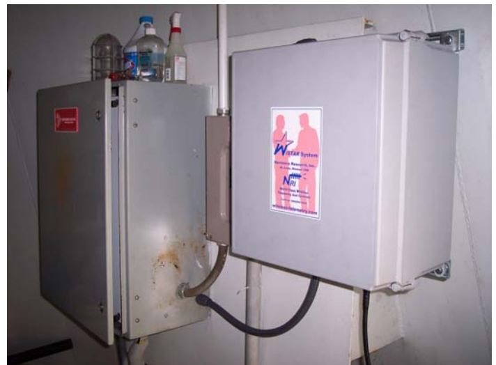
Water Tower TeleTransducer™ Enclosure (Right). This Enclosure Does Not Contain An RTU or PLC.