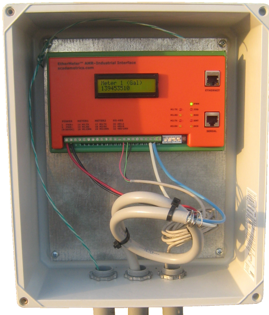
EtherMeter installation is simple and compact.

As an added benefit, the EtherMeter is equipped with 5 auxiliary inputs and outputs, making it suitable for deployment as a standalone RTU at low-complexity locations, such as custody-transfer vaults or even simple pumping stations.